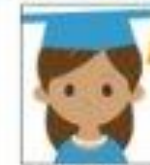
Public university tuition $7,660