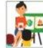
Center-based infant care $11,107