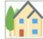
Average annual mortgage payments $17,064