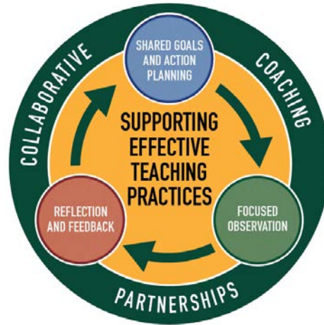
Exhibit 2. Practice-Based Coaching